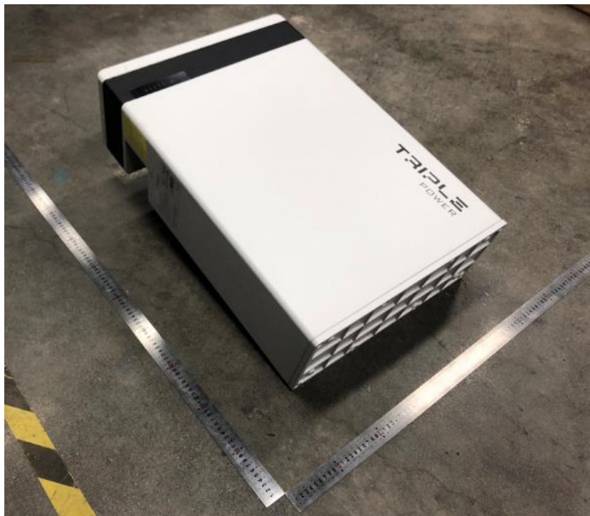
图 1 电池侧面 Picture 1 Side view of Battery