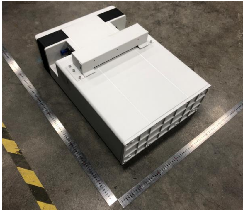
图 2 电池背面 Picture 2 Back view of Battery