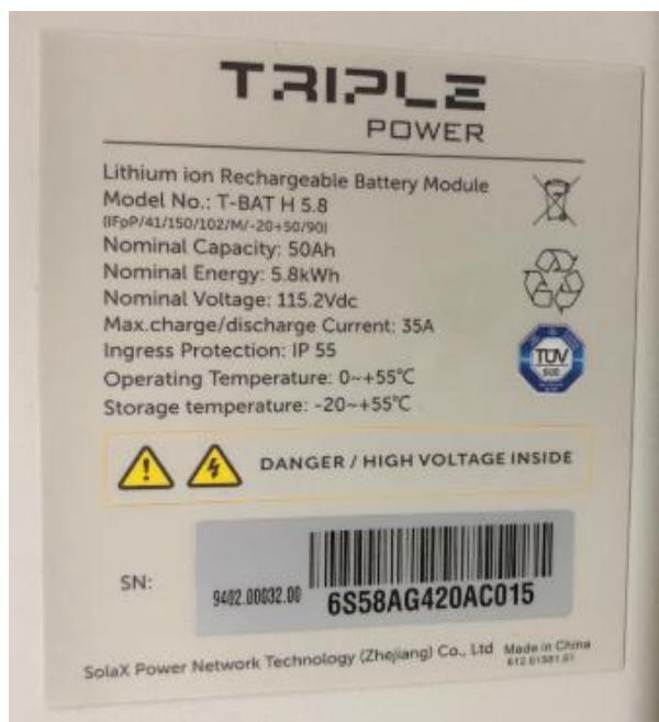
图 4 电池标签 Picture 4 Label of Battery